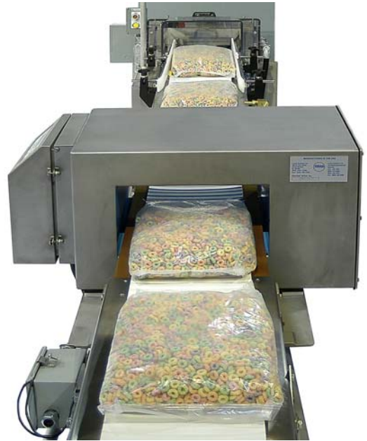
KRAKEN KSIT/MD-100 ▲ High Speed Servo Infeed and Transfer System c/w Metal Detector

The transfer precision placement device, (fins/paddles) in The transfer hood of the KSTM-240, is supplied in variable Designs to accommodate a variety of product parameters and characteristics which allow for optimum performance. (Contact Kraken for information and specs that meet your product requirements).